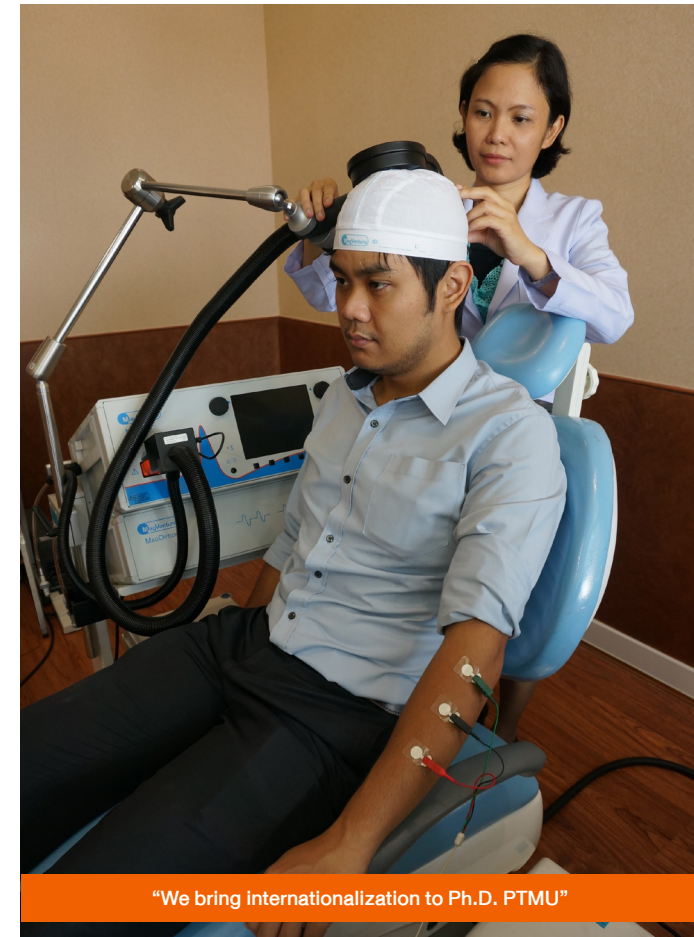
"We bring internationalization to Ph.D. PTMU"